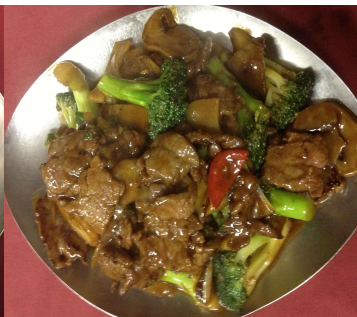
* Beef Broccoli