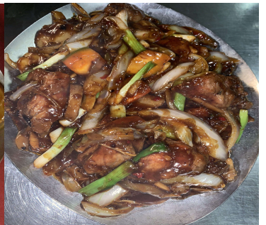
* Mongolian Steak