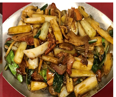
Pork Mixed Vegetables

* Hot And Spicy - We will prepare to suit your taste