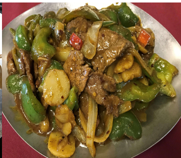
* Curry Beef