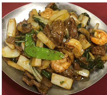
Double Luck Chow Yok