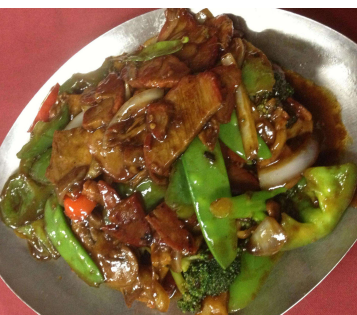
* Mandarin Style Pork