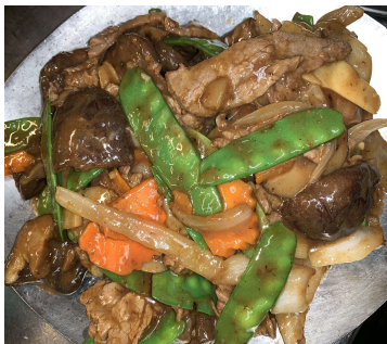
Beef with Black Mushroom

Sliced pork sauteed with broccoli, mushrooms, water chestnuts and onion in a spicy sauce.