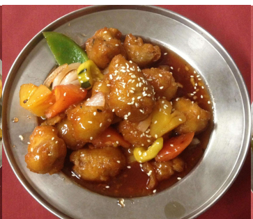
Sweet & Sour Pork