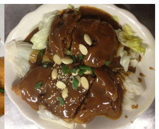
WOO SHU CHICKEN

* Hot And Spicy - We will PREPARE TO SUIT YOUR TASTE