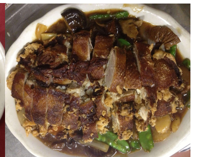
DUCK w/ BLACK MUSHROOMS