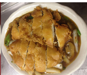
HUNG SHU CHICKEN